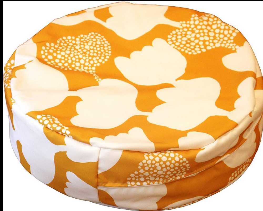
ULPUKKA pattern by RATIA