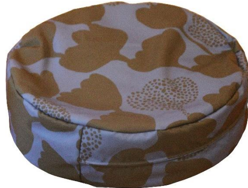
ULPUKKA Black & Navy