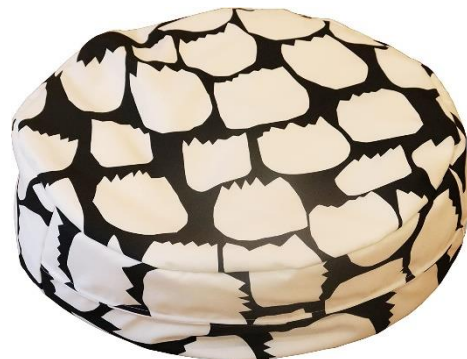
NEILIKKA White & Black