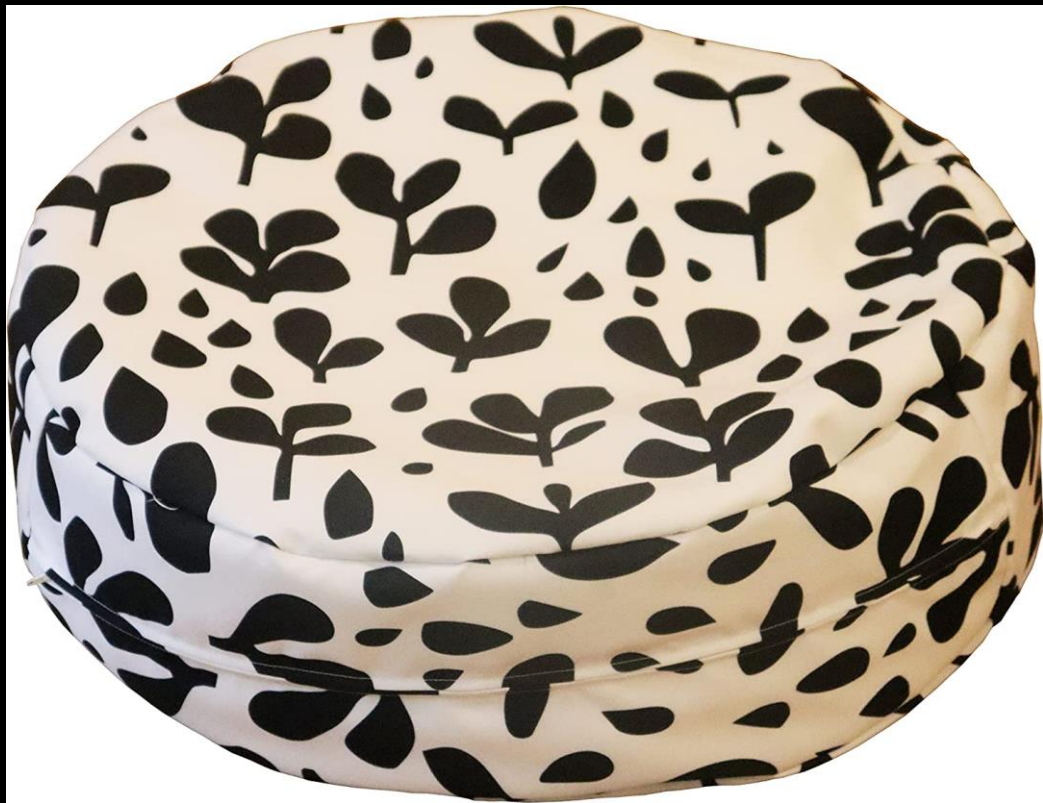
RAIN pattern by RATIA