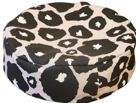
ORVOKIT Black & Grey