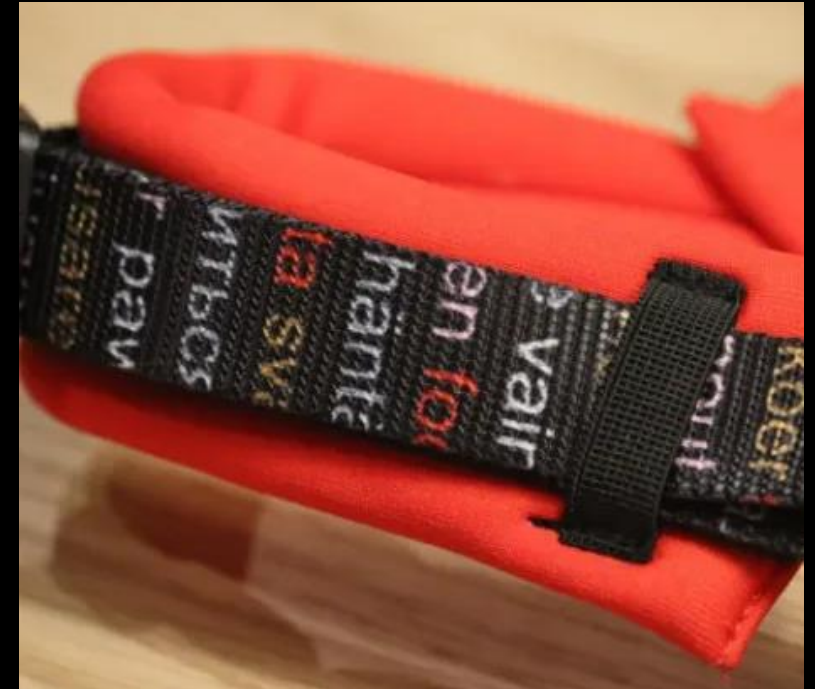
Multilingual GRAFICO pattern by RATIA

With the diversification of our product lines, we are creating products that are not only practical and durable, but at the same time pleasing to the eye.