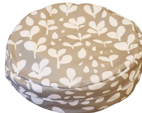
RAIN Beige & White