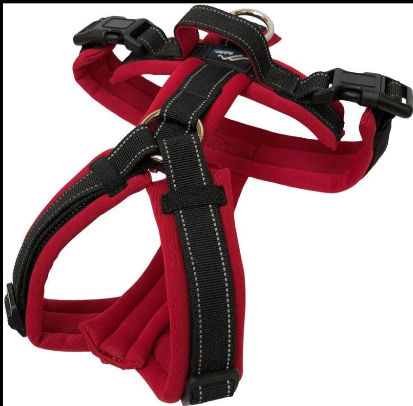
Hakusan Zero Harness