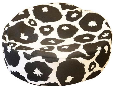
ORVOKIT Black & White