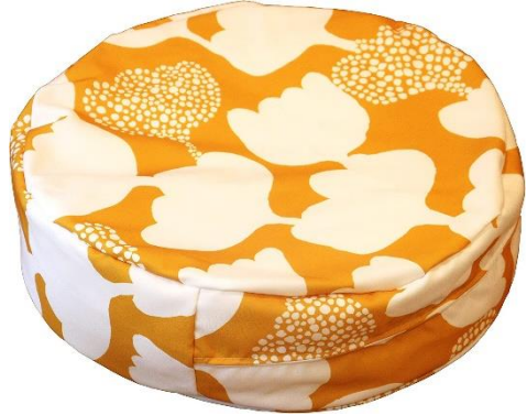
ULPUKKA Orange & Yellow