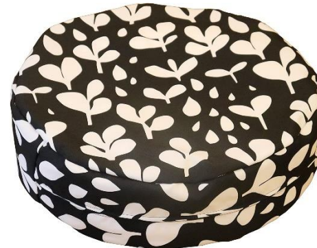
RAIN Black & White