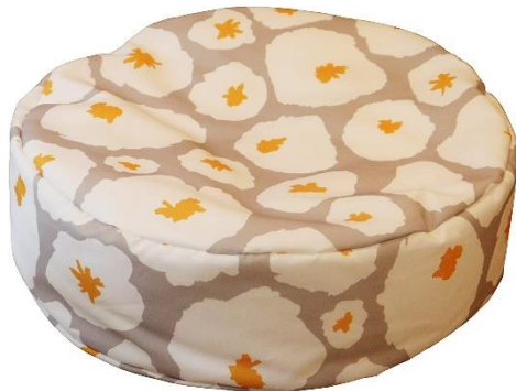
ORVOKIT White & Grey