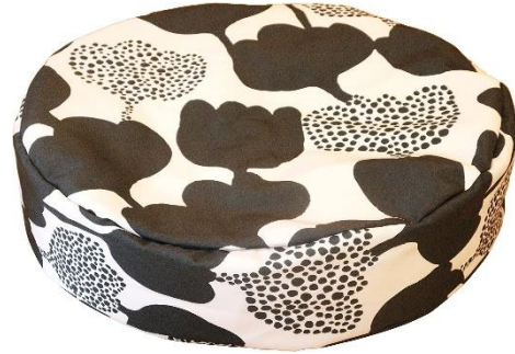
ULPUKKA Black & Grey