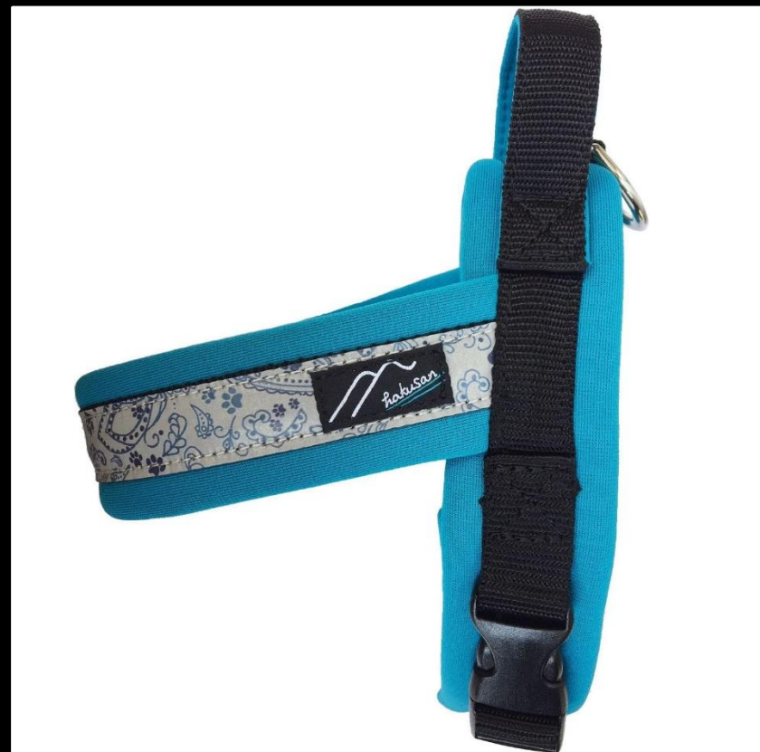
Hakusan Just Fit Harness