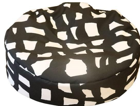
BLOCK Black & White