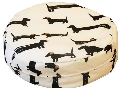
DOGS White & Black