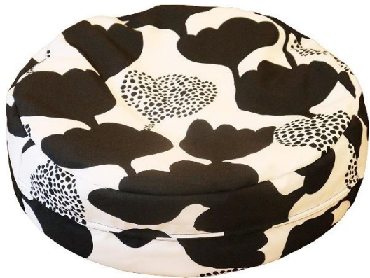
ULPUKKA Black & White